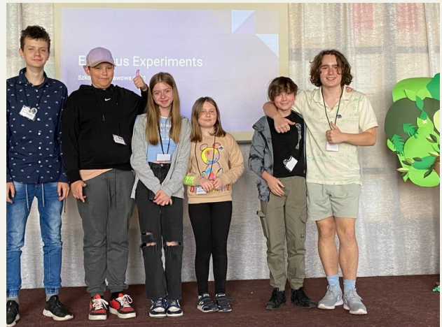
During the meeting pupils presented their learning about the Greenhouse Effect and its effects on the environment.