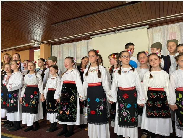
Traditional welcome at school with bread and salt.

22 - 26 May - in Osnovna škola "Vuk Stefanović Karadžić" in Kragujevac in Serbia